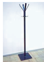
Black hanger a stelo nero