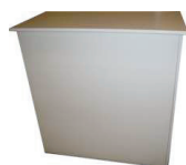
Desk reception dim. 50x100x102 h