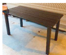
Rectangular table black 140x70x72 h