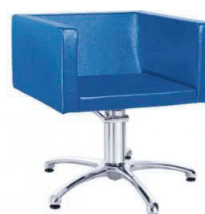
Armchair blue living room