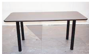
rectangular table gray 150x70x72 h