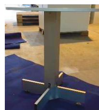
Round table white 60 cm x 70 cm h