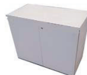
Cabinet with opening doors and key 80x40x70 h