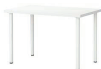
Rectangular table white 120x70x72 h